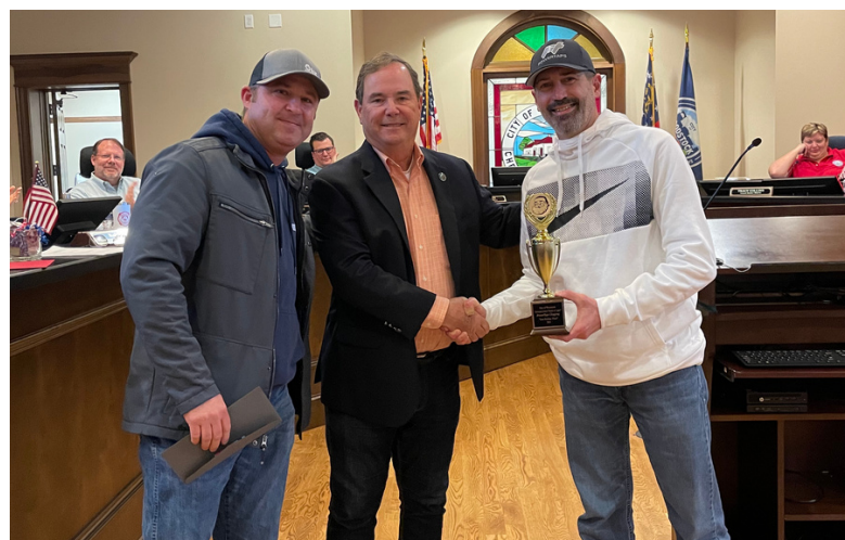
Best Holiday Power Taps Clogging