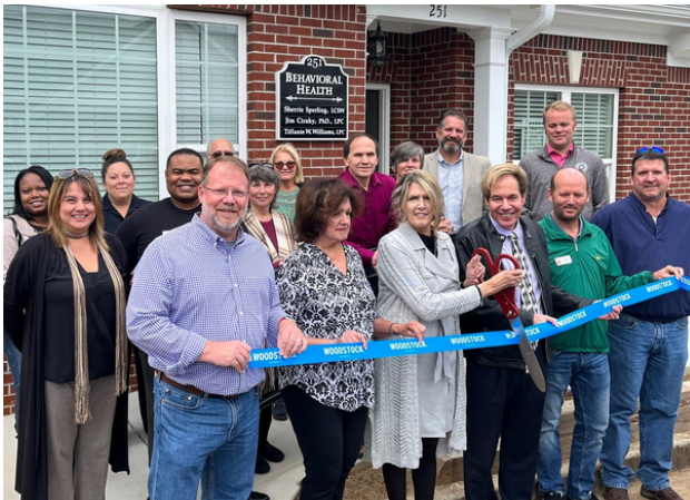
IN WDSTK held a ribbon cutting for Days of Hope Counseling and Behavioral Health on November 3rd. Days of Hope is located in River Park off Highway 5 in Woodstock.