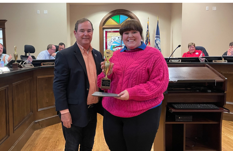
History & Heritage Bug Busters, Inc.