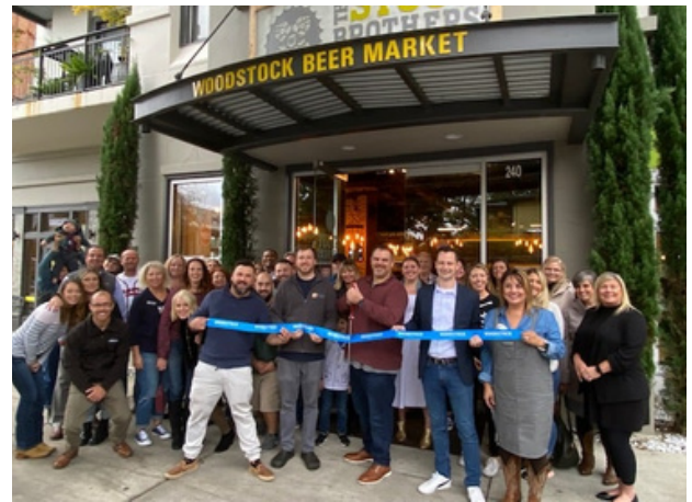
On October 29th, IN WDSTK held a ribbon cutting to celebrate the grand opening of Woodstock Beer Market on Chambers Street in Downtown Woodstock.