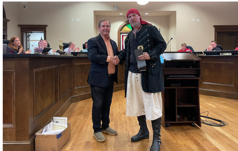
Most Original Nocturnal Pirates of Atlanta