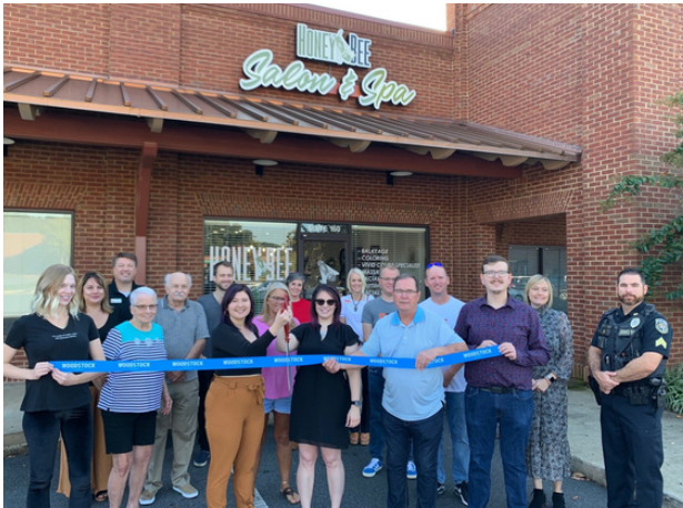
On October 15th, IN WDSTK held a ribbon cutting to celebrate the grand opening of Honey Bee Salon & Spa on Highway 92 in Woodstock.