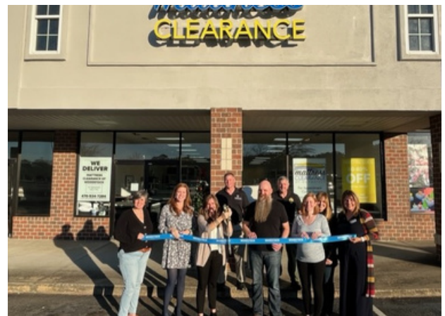
IN WDSTK held a ribbon cutting on November 30th for Mattress Clearance of Woodstock on Highway 92.