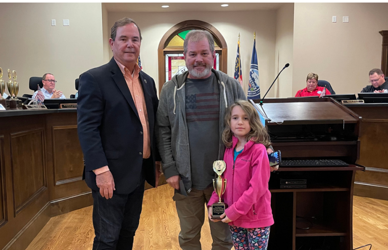
People's Choice Let's Pretend Publishing

Here are the parade float winners for 2021!